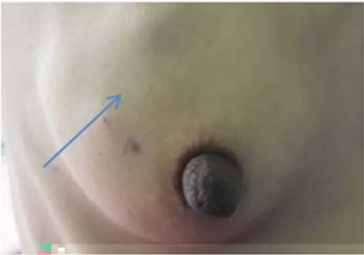
Figure 1: The clinical picture of right breast lump (arrow).