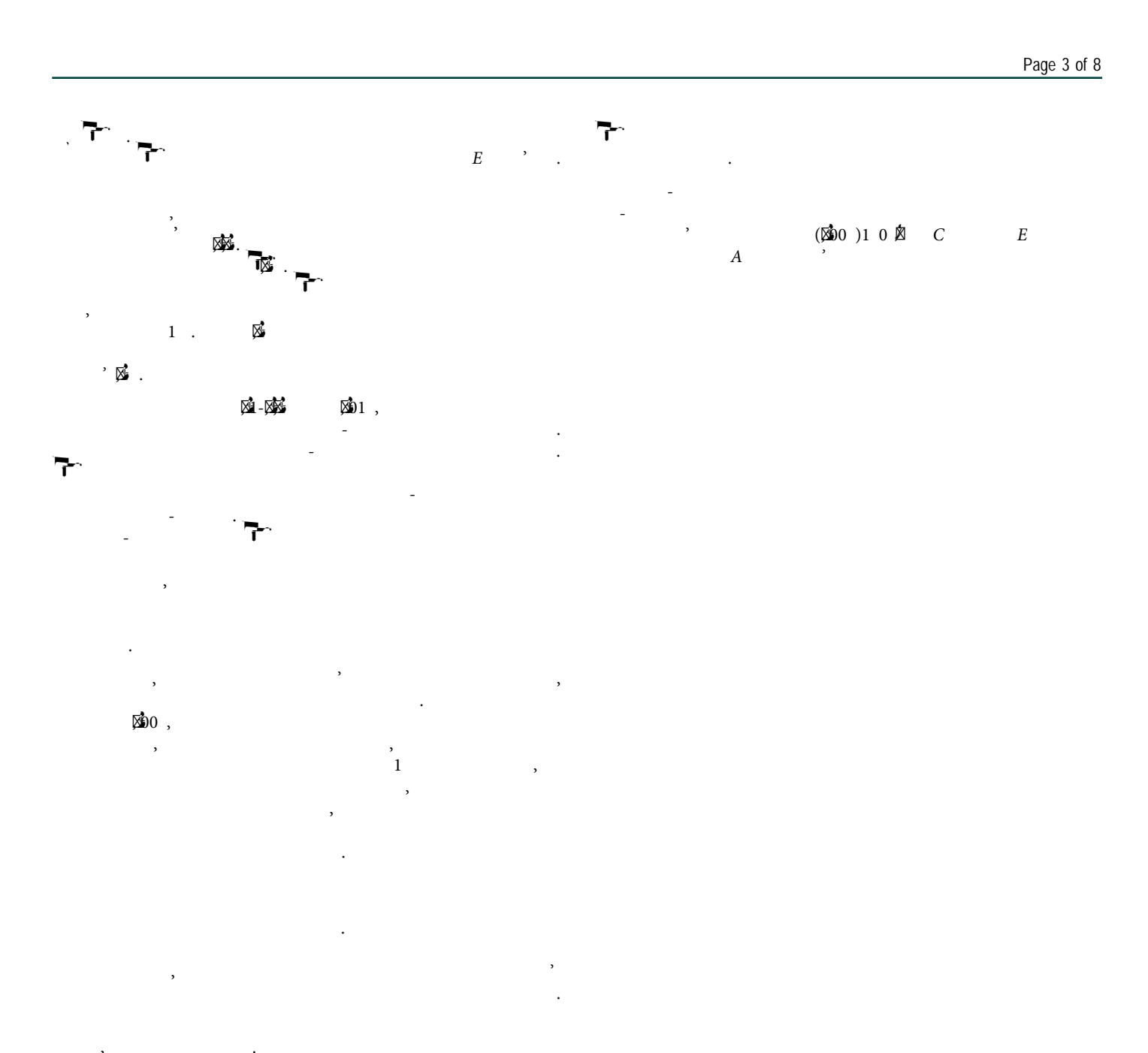
M_{1,1} Mec a_{1,1} . a_{1} d_{1} . e_{1} R_{1} e_{1} f La<sup>T</sup>AC a_{1,1} e_{1}