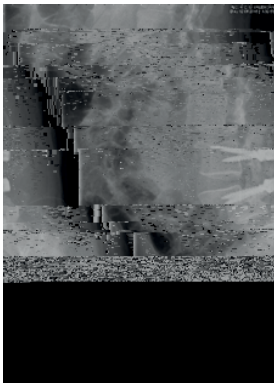
Figure 2: Concept of maintaining the elements mobile as against those of keeping them rigid.