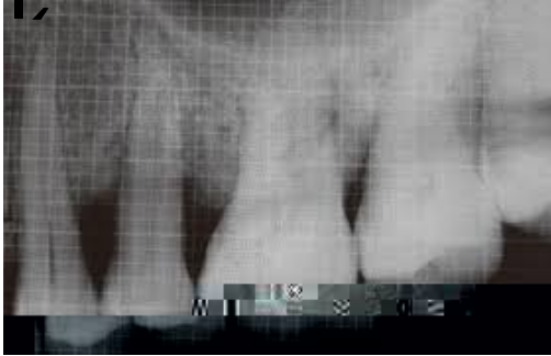
Figure 2 X-ray showing anxiety just melts away.