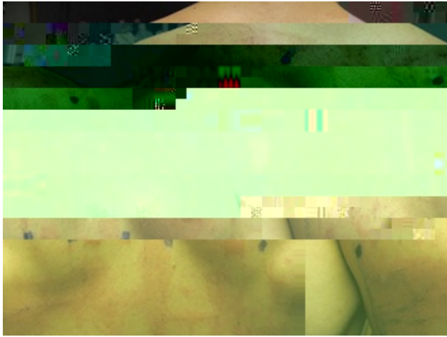
Figure 1: H positive patch test to diethylthiourea was a vesiculo-bullous, oedematous and a V L J Q L } E L D V H } Eczematous reaction on the scapular area of the right side of the back.