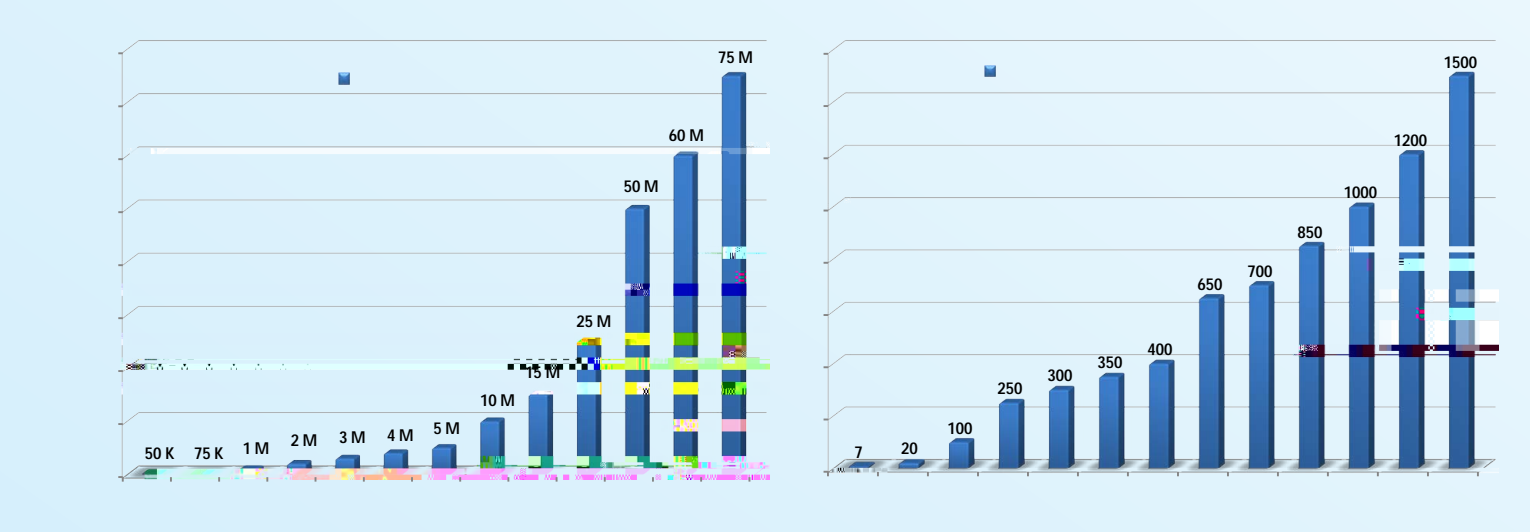
Discipline wise Number of Journals