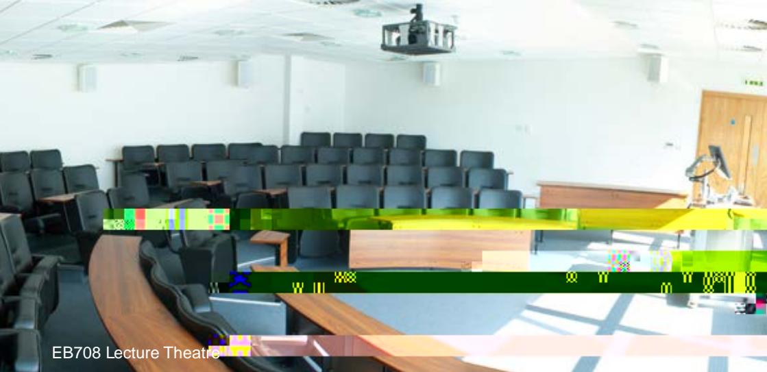
EB708 Lecture Theatre